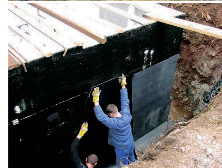
UBTS 12(24) 630 IN THE GROUND