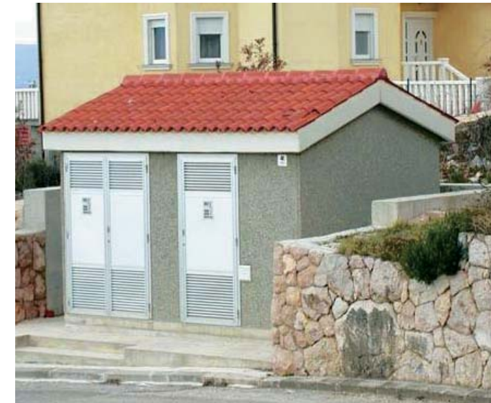
TS MTS 12 (24) - 630 (1000) sloping roof

Type: TS MTS 12 (24) - 630 (1000) sloping roof