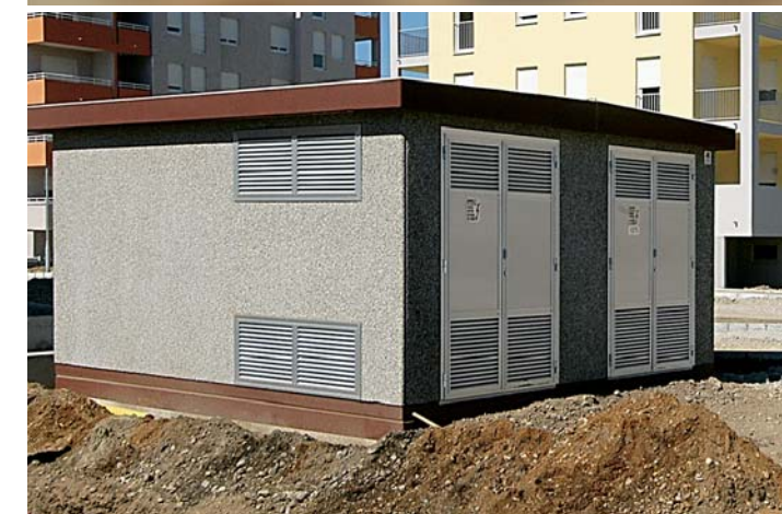
TS DTS 12 (24) 2 x 630 (2 x 1000)