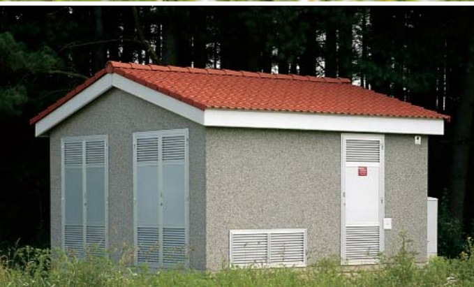
TS DTS 12 (24) - 2 x 630 (2x1000) sloping roof