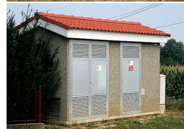
TS KTS 12 (24) - 630 (1000) sloping roof