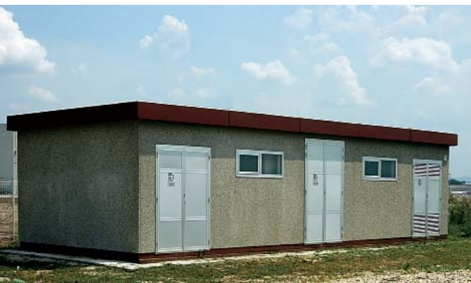
DASH BOARD TRNOVEC 630 (1000)