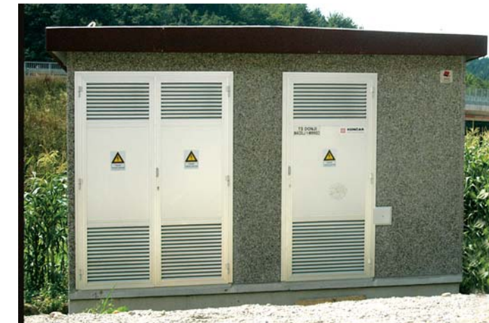
TS KTS 12 (24) - 630 (1000)