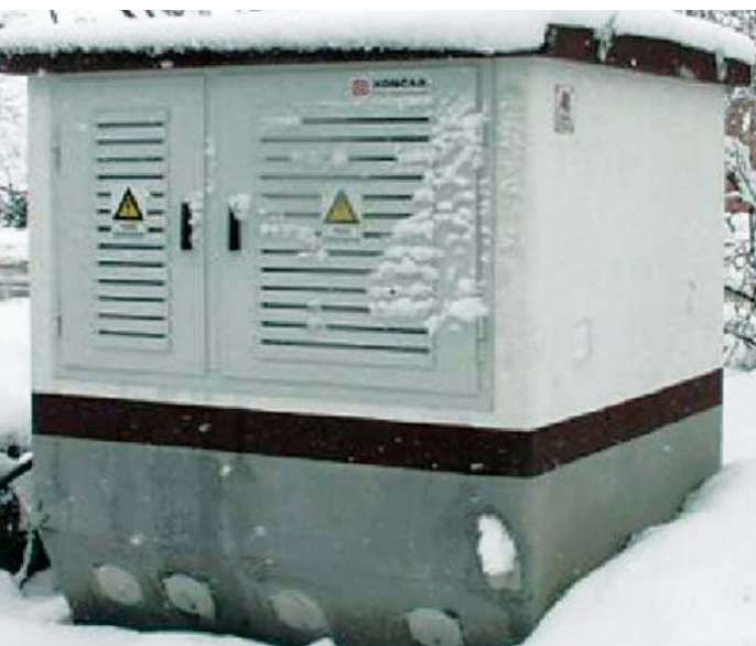
VTSK 12 (24) - 250