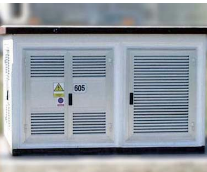
MKTS 12 (24) - 630