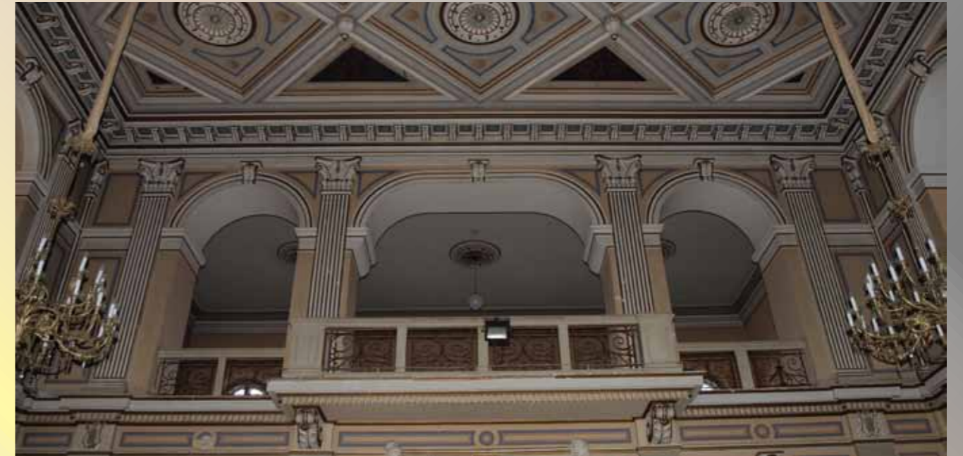
HNK / CROATIAN NATIONAL THEATRE VARAŽDIN