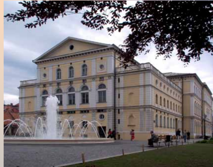
HNK / CROATIAN NATIONAL THEATRE VARAŽDIN