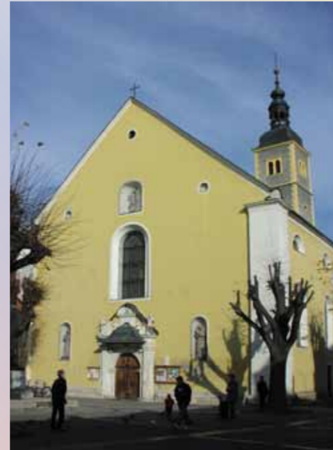
FRATERSKA CRKVA / FRATER CHURCH VARAŽDIN