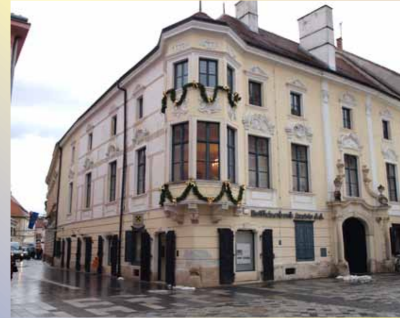
PALAČA PATAČIĆ / PATAČIĆ PALACE VARAŽDIN