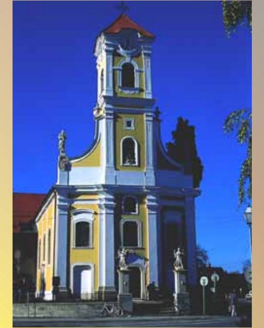
CRKVA SV.FLORIJAN / CHURCH ST.FLORIJAN VARAŽDIN