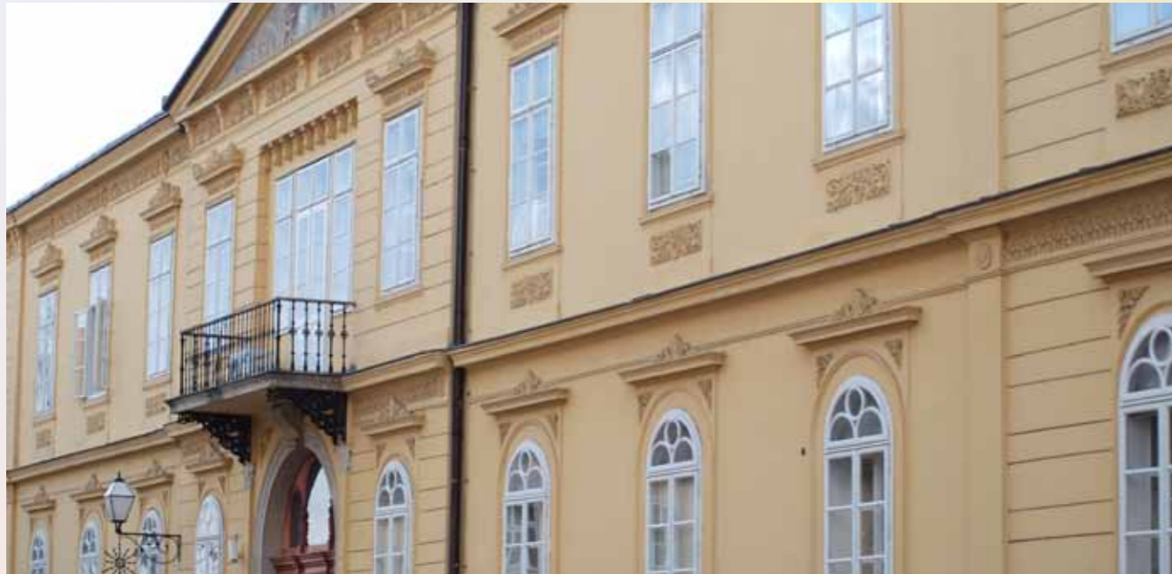
BISKUPSKA REZIDENCIJA / BISHOP'S RESIDENCE VARAŽDIN